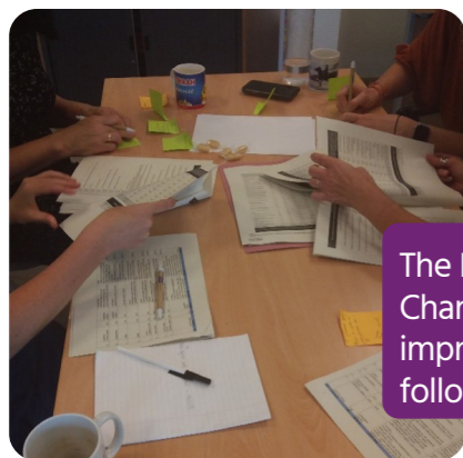
The Engagement Champions discussed improvements following feedback.

"It was good to meet other Locala colleagues and be able to network and learn more about each other's roles."