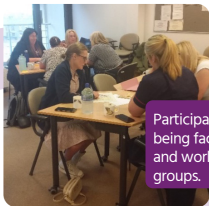
Participants enjoyed being face to face and working in groups.